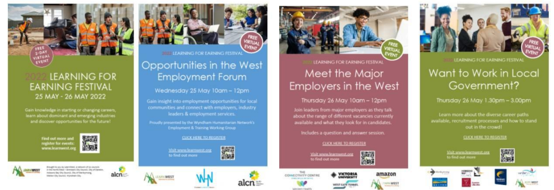
Learning for Earning Generic Poster and Signature Forum Event Posters